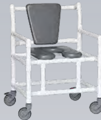
VL OF500 G 41.5"H x 30.5"W x 27.5"D 26.5" between the arms