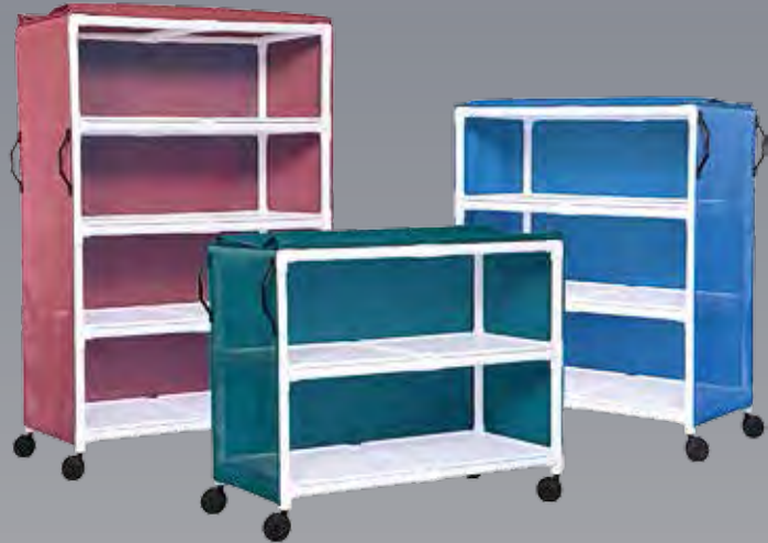
VL LC242 43"H x 52"W x 24"D