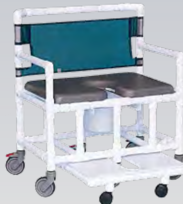
VL OF20 P 700 FR 41.5"H x 35.5"W x 28.5"D 31.5" between the arms