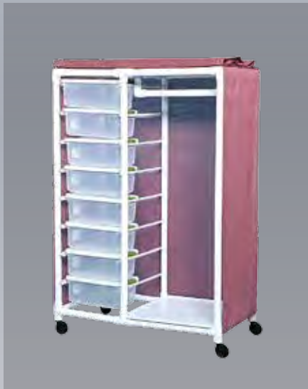
VL DBC16 65"H x 44.5"W x 24"D 16 bins, 22" hanging bar