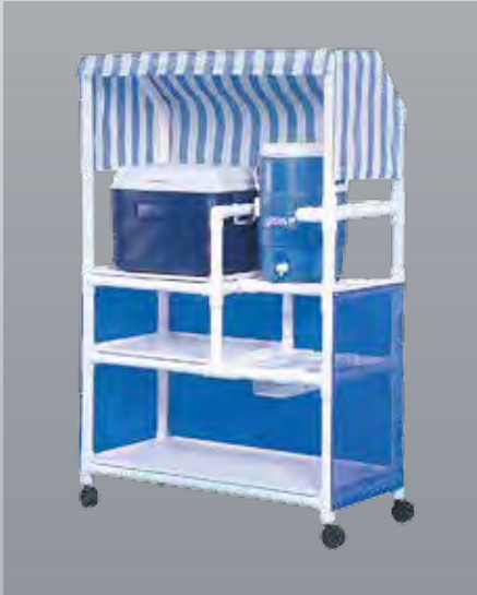
VL CHC48 WC 66"H x 50"W x 20"D