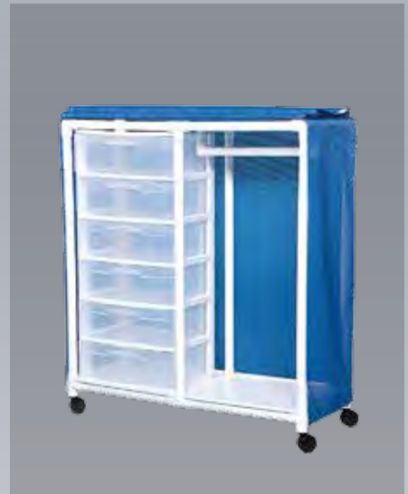
VL GR66 56"H x 50"W x 20"D 6 drawers, 20" hanging bar