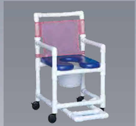
VL OF17 P FR