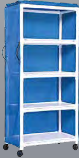
VL LC4 S 79"H x 38"W x 20"D