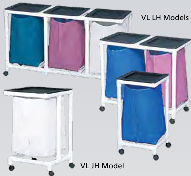
VL LH Models