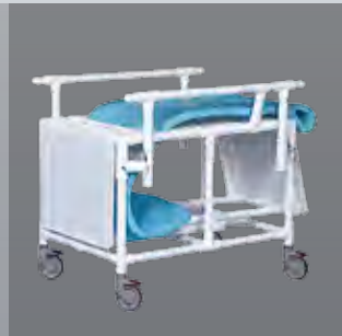
Folding shower bed saves storage space