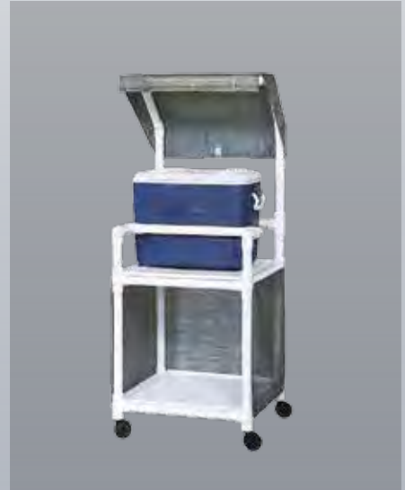
VL IC40 76.5"H x 26"W x 24"D