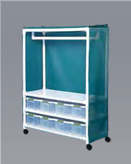
VL DBC8 65"H x 50"W x 20"D 8 bins, 44" hanging bar