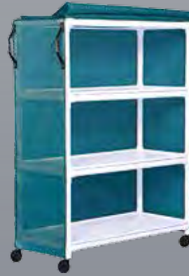
VL LC3 L 61"H x 47"W x 20"D