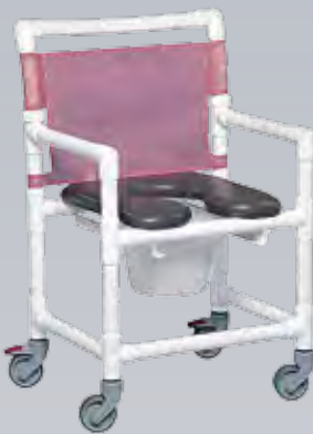
VL OF9200 MS (No Pail) VL OF9250 MS (With Pail) 41"H x 25"W x 22"D