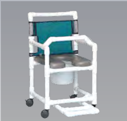
VL OF17 P FRLB