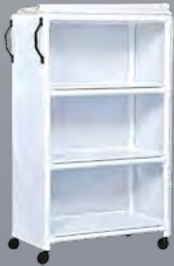
VL LC3 S 60.5"H x 38"W x 20"D

A full line of lightweight and very mobile linen carts.