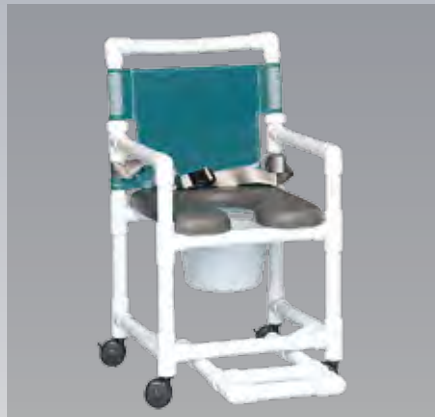
VL OF17 P FRSB