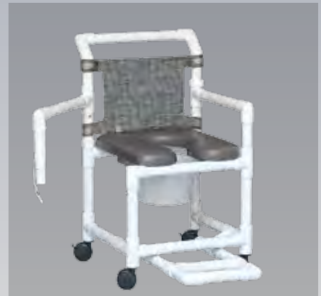
VL OF17 P FRLSA