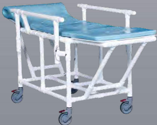
VL FSG350 38.5"H x 32"W x 76.5"D

pad deck: 30.5" H deck width: 28" folded length: 41.5"