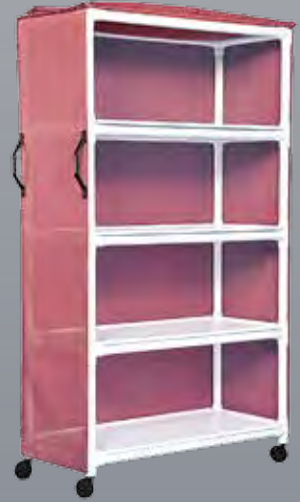
VL LC4 L 78"H x 47"W x 20"D