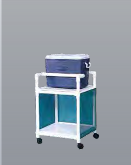
VL IC36 40.75"H x 26"W x 24"D