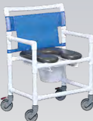
VL OF9200 OS (No Pail) VL OF9250 OS (With Pail) 41"H x 28"W x 22"D