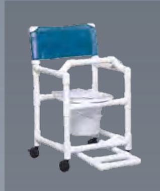
VL SC17 P FRLB