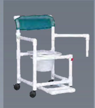
VL SC17 P FRLSA

Dimensions VL SC 17: 38"H x 21"W x 21.5"D VL SC 20: 41"H x 21"W x 21.5"D