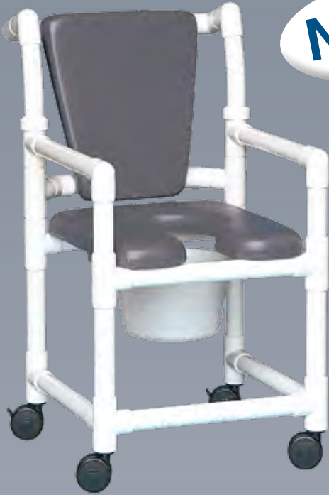
VL OF700 17 P