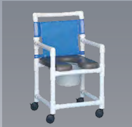
VL OF17 P