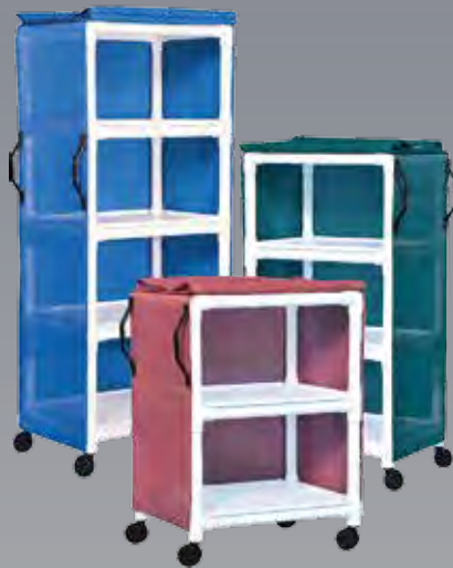
VL MPC275 36"H x 28"W x 20"D