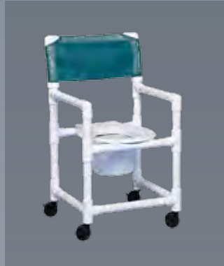
VL SC17 P